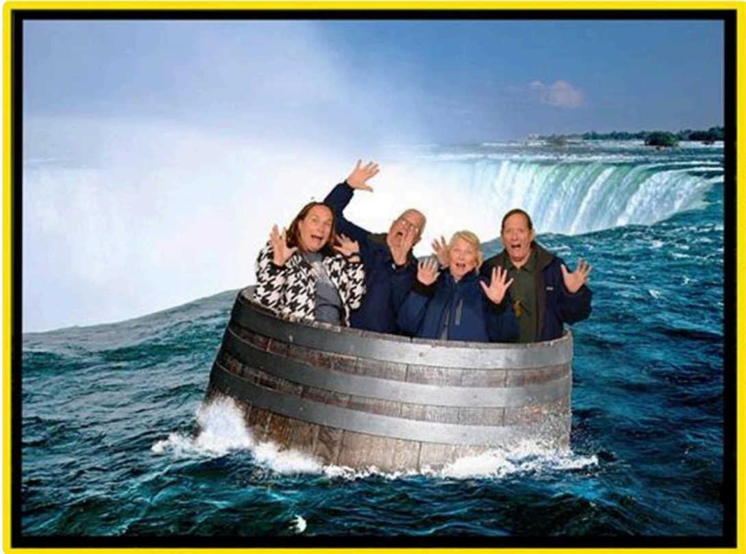
Always an adventure.